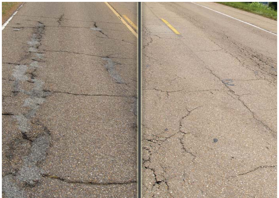
When performing reactive maintenance as a stop-gap measure on structurally unsound roads like these, the treatment life cycle may be greatly reduced.

"For economic reasons they may be using the preservation surface treatment to try to hold the road together as a stop-gap measure until they can rehabilitate or reconstruct. But, if for any reason the agency decides to use a preservation surface treatment where it's not appropriate, then the public should be informed so they'll have realistic expectations as to how long it might perform adequately.